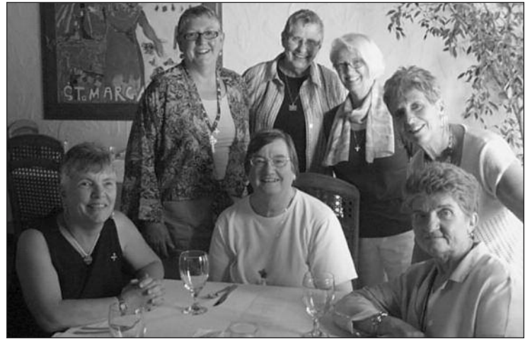
Women from throughout Province VI gathered in Colorado Springs for a summer meeting which coincided with a meeting of the National ECW Board. Shown are scenes from that meeting.